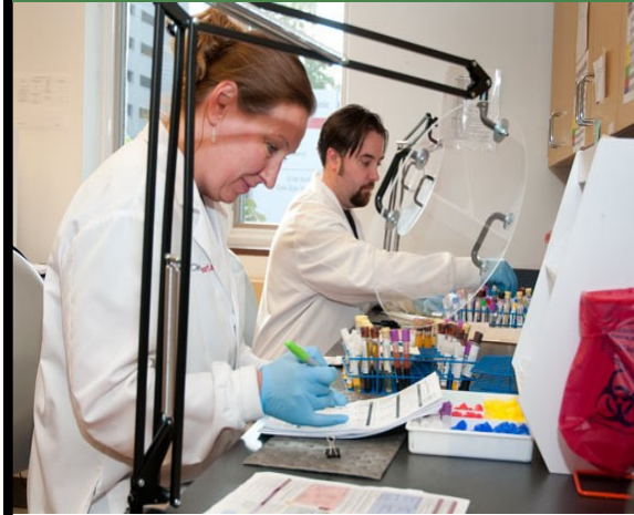
Cleveland Heart Lab